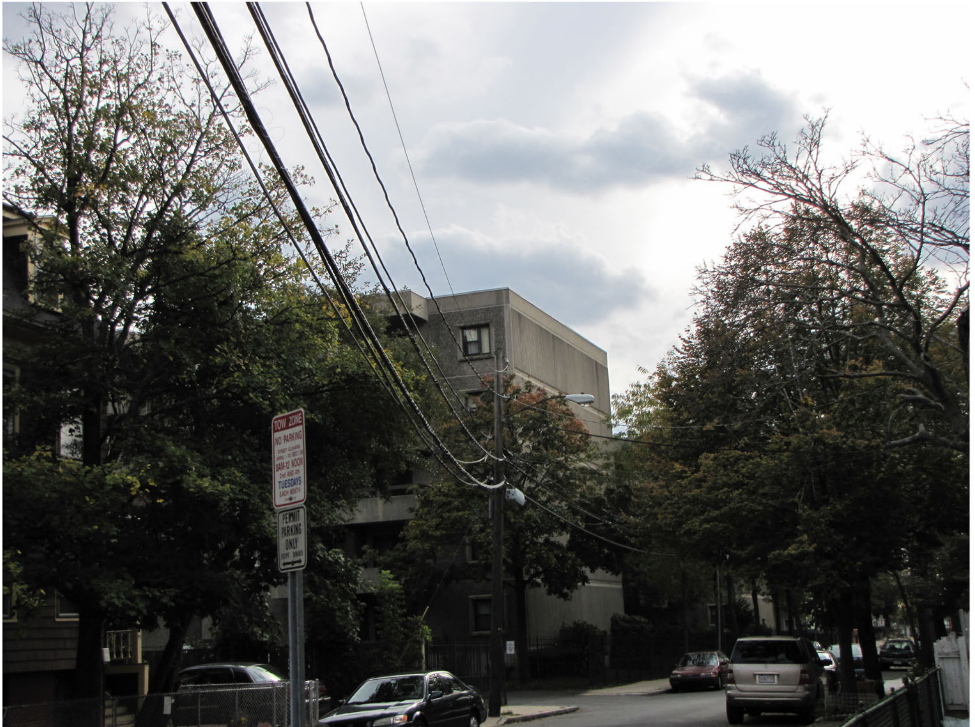
PROPOSED ANTENNAS (NOT VISIBLE) | LOOKING SOUTHEAST FROM THE MIDDLE OF MYRTLE STREET