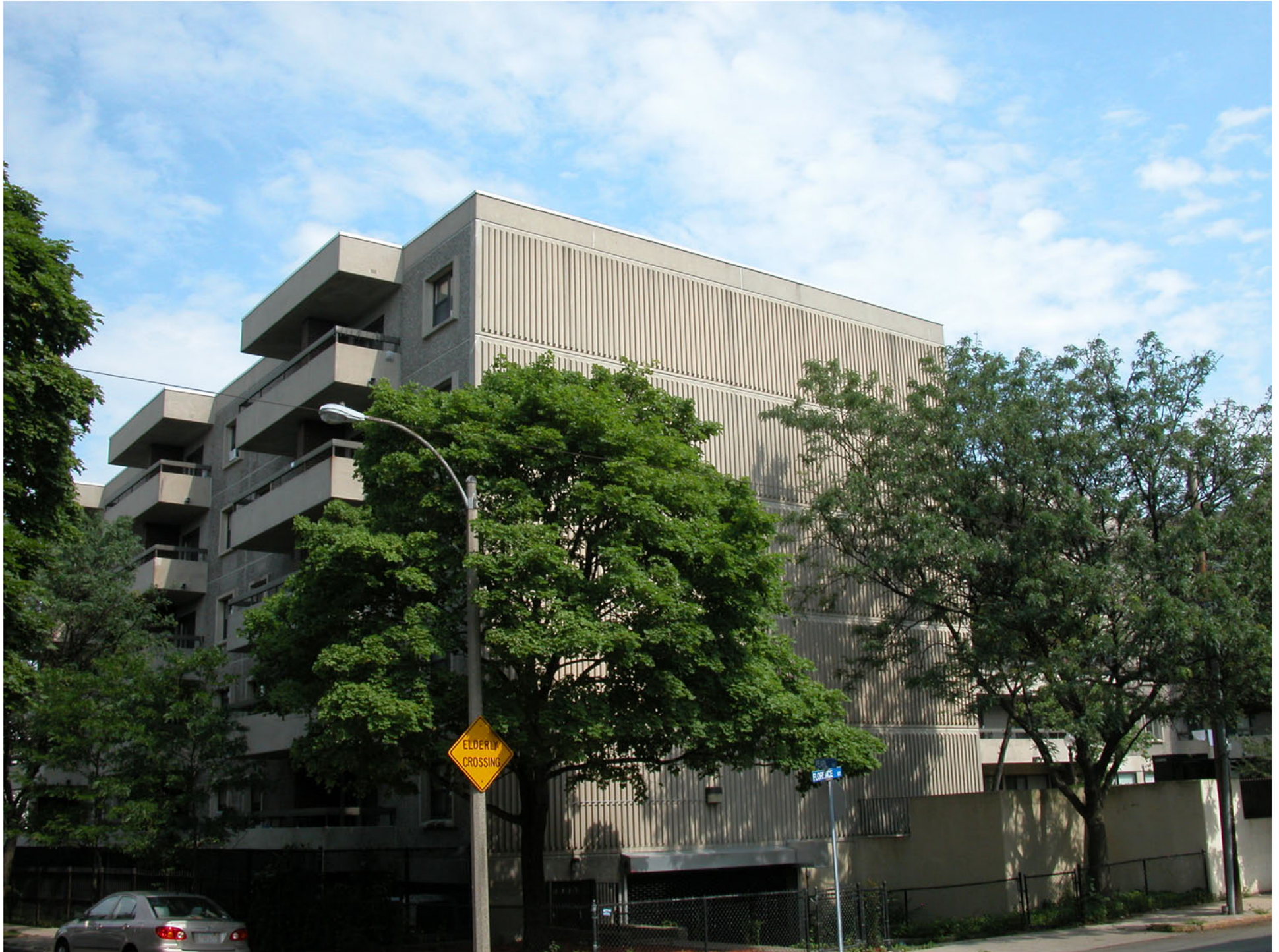
PROPOSED ANTENNAS (NOT VISIBLE) | LOOKING NORTHWEST FROM PEARL ST. & FLORENCE ST.