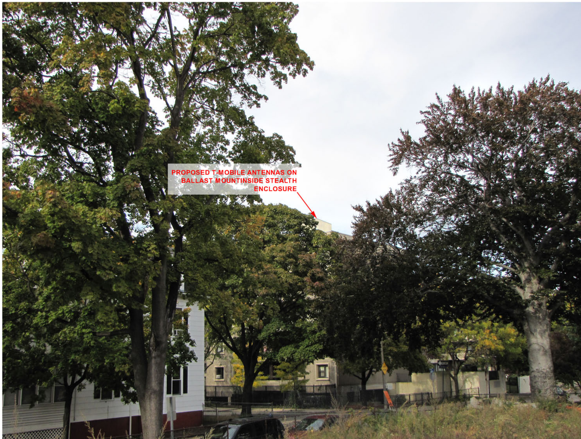
PROPOSED ANTENNAS | LOOKING NORTHWEST FROM VACANT LOT ON PEAL STREET