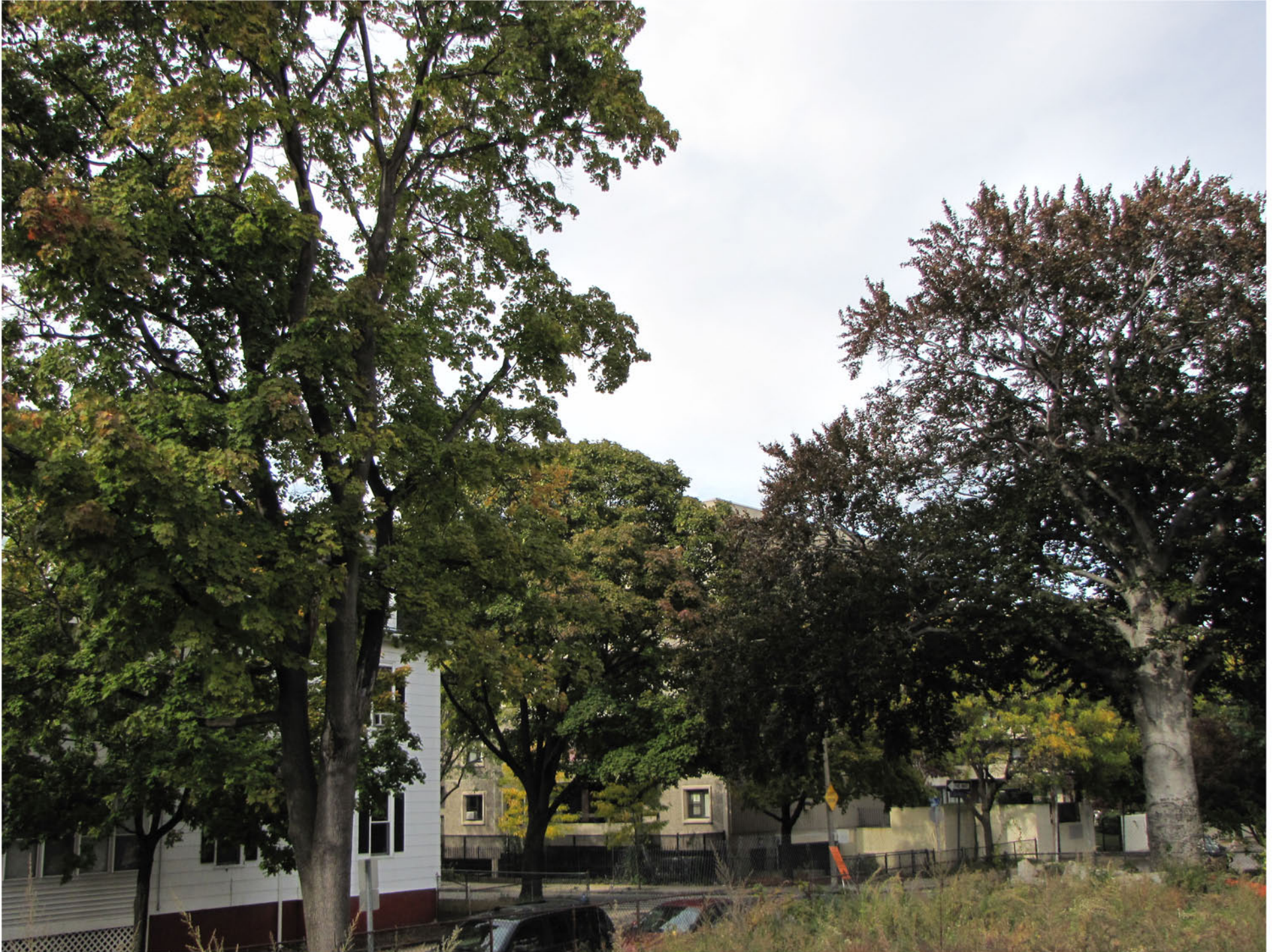
EXISTING CONDITIONS | LOOKING SOUTHWEST FROM PERKINS ST. & FLORENCE ST.