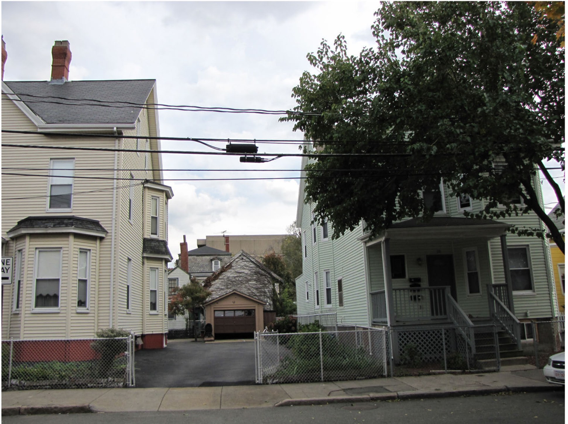
PROPOSED ANTENNAS (NOT VISIBLE) | LOOKING SOUTHEAST FROM WEBSTER STREET & FRANKLIN STREET