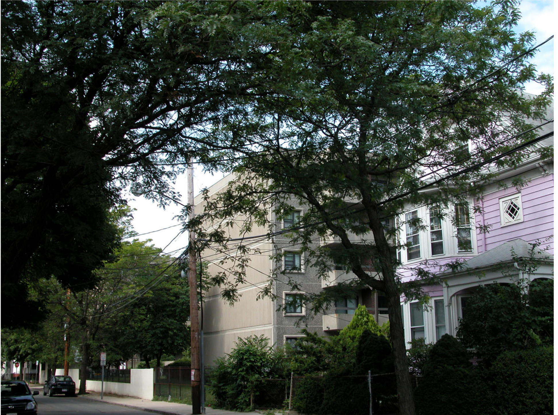
EXISTING CONDITIONS | LOOKING SOUTHWEST FROM PERKINS ST. & FLORENCE ST.