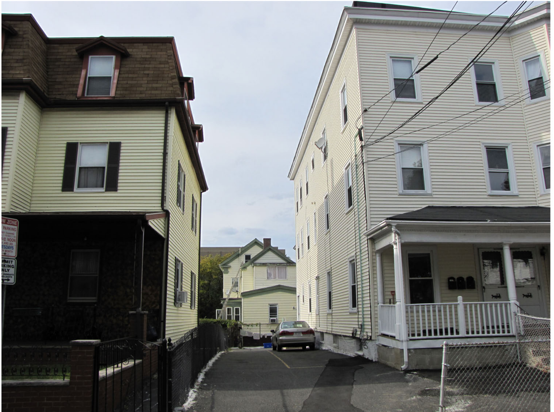
EXISTING CONDITIONS | LOOKING NORTHWEST FROM PINCKNEY STREET