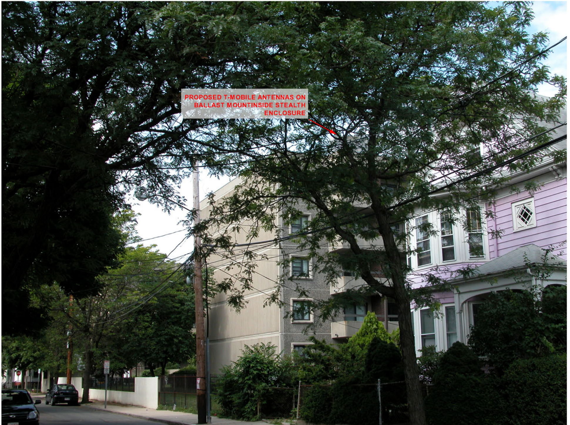
PROPOSED ANTENNAS | LOOKING SOUTHWEST FROM PERKINS ST. & FLORENCE ST.