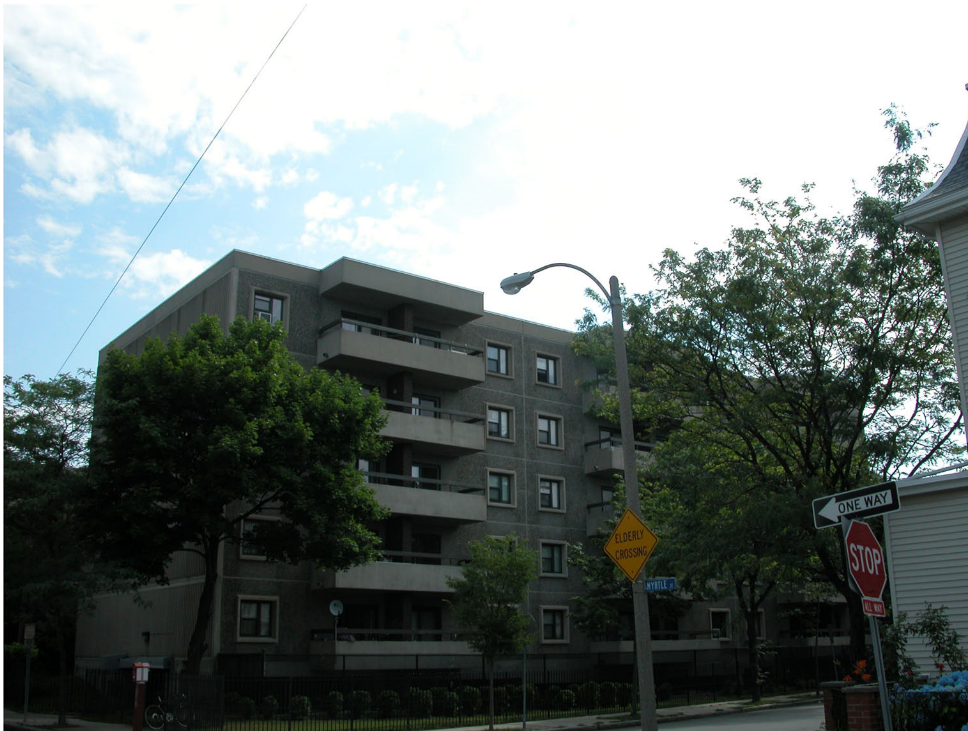
PROPOSED ANTENNAS (NOT VISIBLE) | LOOKING NORTHEAST FROM MYRTLE ST. & PEARL ST.