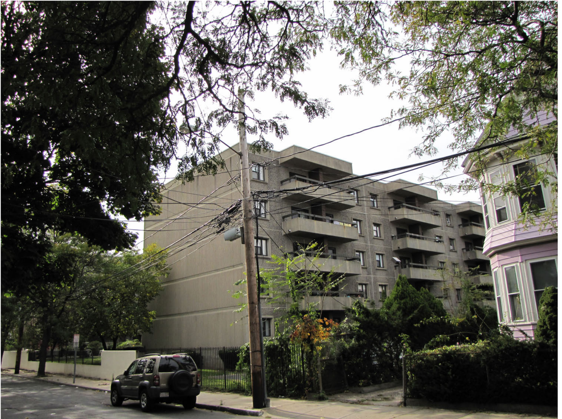
EXISTING CONDITIONS | LOOKING SOUTHWEST 73 FLORENCE STREET