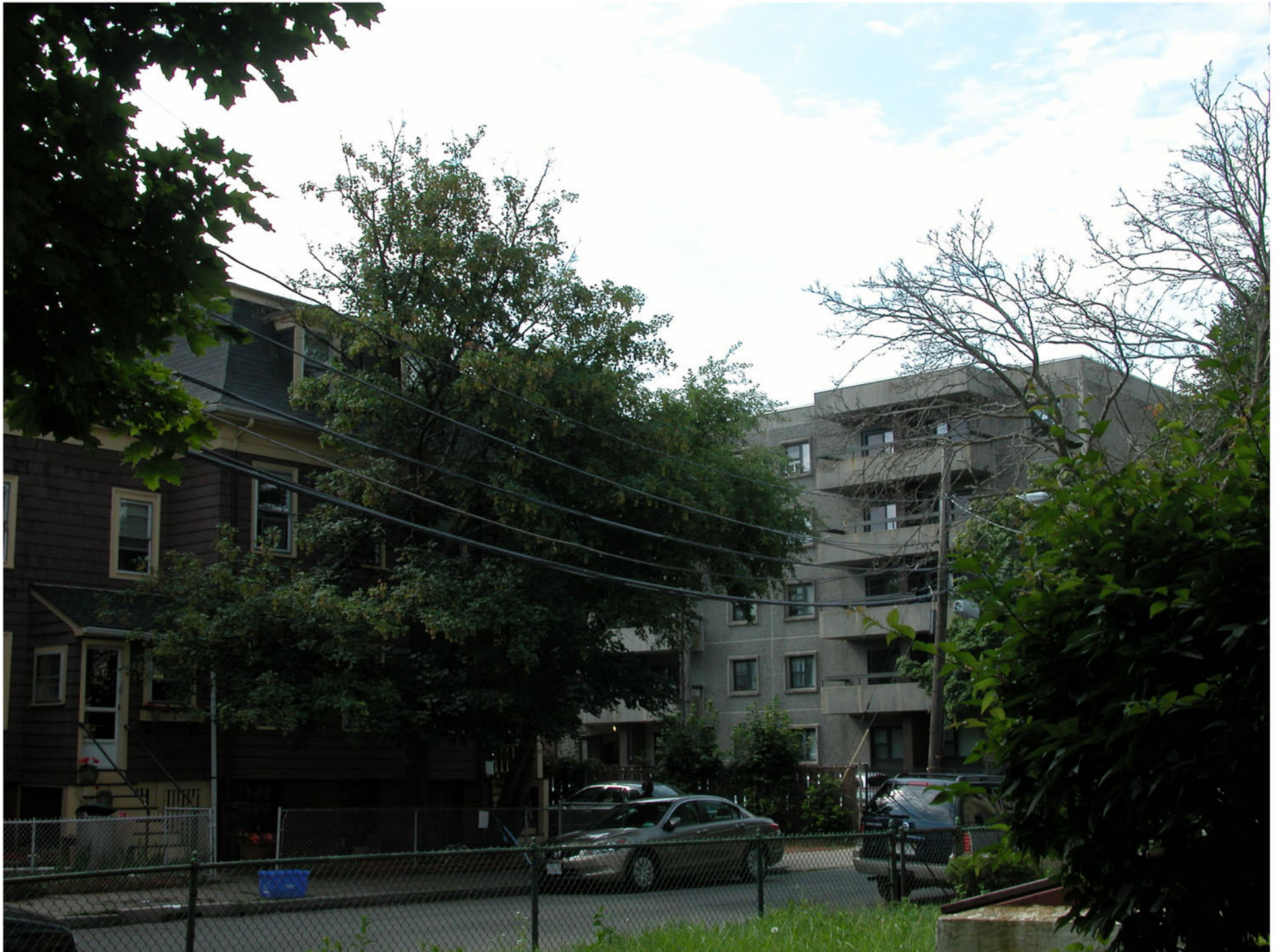
PROPOSED ANTENNAS (NOT VISIBLE) | LOOKING SOUTH FROM PERKINS ST. & MYRTLE ST,